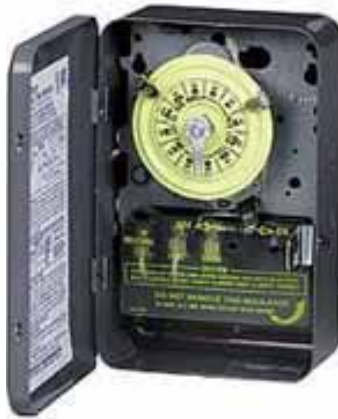
Intermatic T101 Timer

Designed for industrial, commercial and residential applications. Highest HP ratings in the industry for loads up to 40 amps, providing direct 24 hr. control of most loads. Provides 1 to 12 "ON/OFF" operations each day with minimum ON/OFF times of 1 hour. All models equipped with one "ON" and one "OFF" tripper.