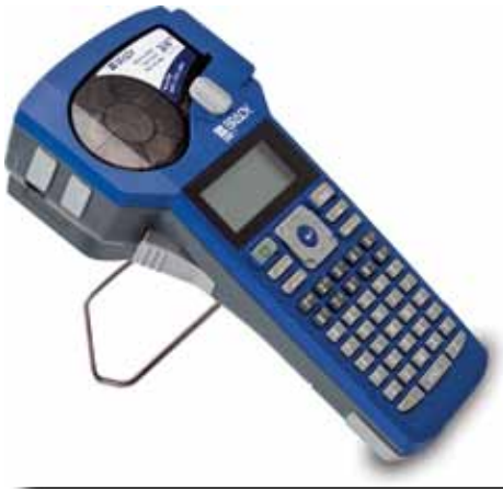
Brady BMP21 Label Printer

Thermal transfer printer creates clear, legible, industrial strength labels that will stay stuck for years --- even in the harshest environments.